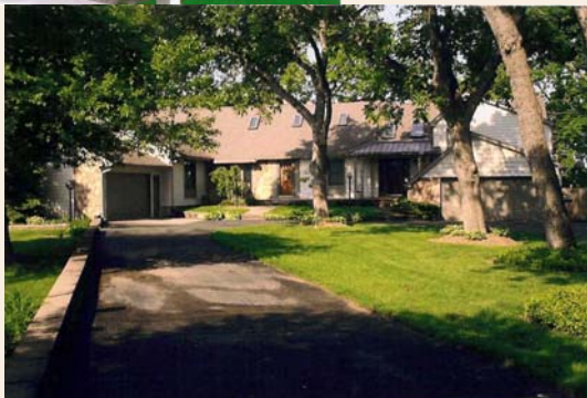
The Patton Home on Lake Pointe Pass