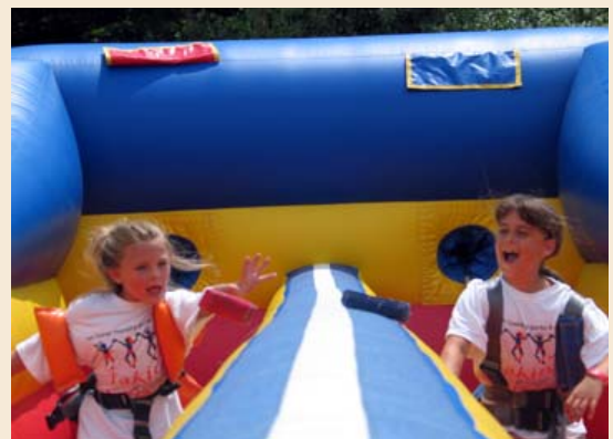
Having fun at Takin It to the Streets!