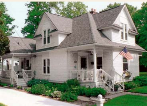
The Juriga Home on East Huron River Drive

A Home Tour Soup & Salad Buffet Luncheon will be held at the Belleville Masonic Temple on tour day from 11:30 a.m. to 3:00 p.m. Luncheon tickets are $6.50. The Temple will also be open for tours.